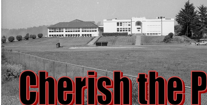
Reedsport Pioneer School c.1965