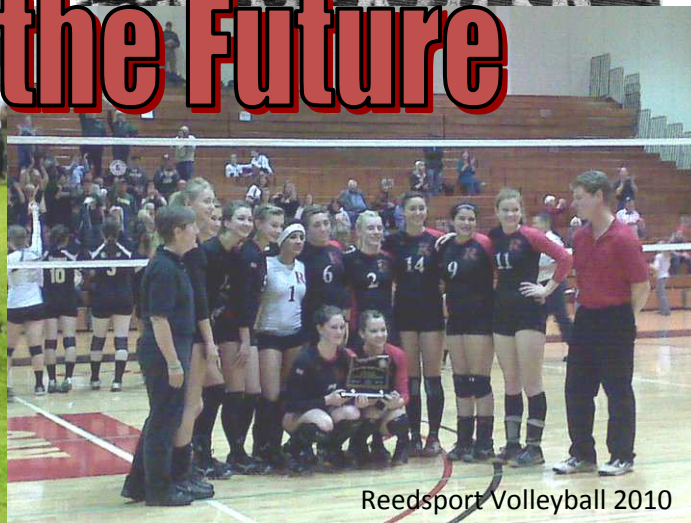
Reedsport Volleyball 2010