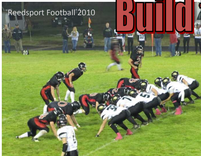
Reedsport Football 2010